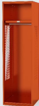
KD w/ Shelf

NOTE: Only an option on models equipped with a Security Box