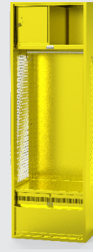
KD with Shelf, Security Box & Footlocker