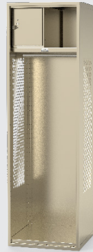
KD with Shelf & Security Box